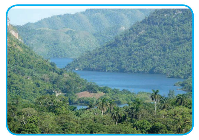
Mountains are a good source of water.

According to reports by the Intergovernmental Panel on Climate Change (IPCCC), the scientific intergovernmental authoritative body that advises Governments on climate change issues, average global temperatures are expected to rise from 1.4-5.8°C by the end of the 21st century. IPCC further asserts that warming occurred at a rate of 0.7 over most of Africa during the 20th century though not all areas warmed at the same rate. Several projections suggest that a 4°C rise in temperature would eliminate nearly all of the world's glaciers.