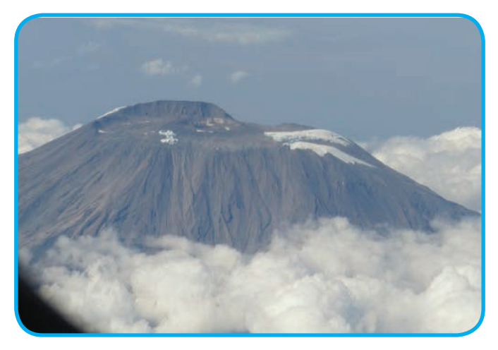
Reduction of ice on Mount Kilimanjaro.

Some of the impacts of climate change in African mountains